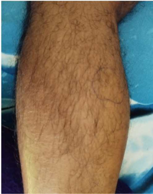
Fig 1: Swelling

though it was painful. He was walking in non-weight bearing pattern using walker. M.R.I report suggested, there was fluid collection in left calf muscle, between Soleus & medial head of Gastrocnemius, most prominent at the myotendinous junction. There was also tear with oedema in anterior fibres of left mid & distal part of lateral head of Gastrocnemius & anterior fibres of distal part of medial head of Gastrocnemius. The patient was treated with L.L.L.T for 15 sittings & was advised to apply Cryotherapy followed by crepe bandage application.