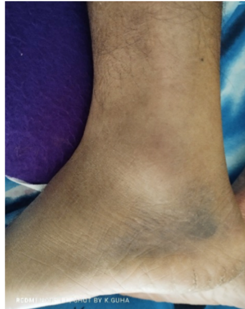
Fig 2: Bruise marks

Dosage of laser used Frequency- 6000 Hz. Mode- Pulsed mode (80%).