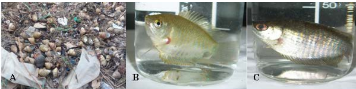
Figure 1:(A)Shells of Snails thrive in upper lake(B)Ornamental fish Trichogaster lalius from shallow region of upper lake catchment areas; (C)Ornamental fish Badis badis from shallow region of upper lake catchment areas.