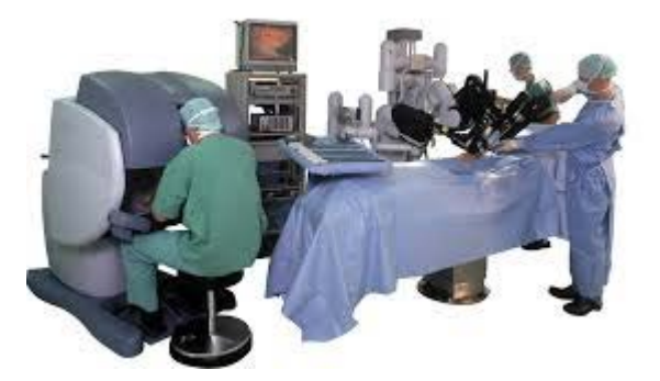
DA_VINCI SURGICAL SYSTEM(Figure 2)<sup>[5]</sup>

■ Thoracoscopically-assisted cardiotomy procedures The da Vinci is intended to assist in the control of several endoscopic instruments, including rigid endoscopes, blunt and sharp dissectors, scissors, scalpels, and forceps. The system is cleared by the FDA to manipulate tissue by grasping, cutting, dissecting and suturing.<sup>[5]</sup>