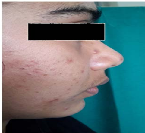
Figure 16: Image showing topical corticosteroid induced exanthema