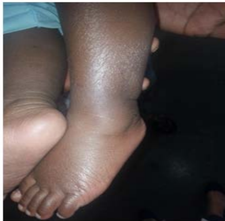
Figure 15: Image showing Hypopigmentation due to Mometasone Furoate