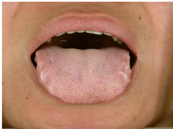
Figure 3 dentate tongue

and the coronary artery obstruction have a certain correlation (Figure 6).