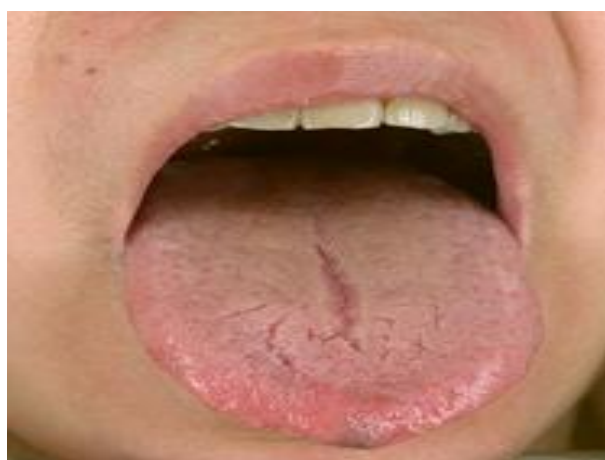
Figure 6 Ecchymosis tongue