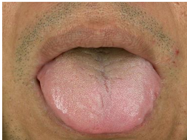
Figure 4 pale tongue