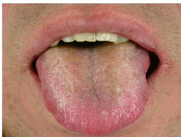
Figure 5 yellow tongue red greasy