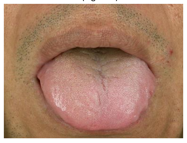
Figure 4 pale tongue

and the coronary artery obstruction have a certain correlation (Figure 6).