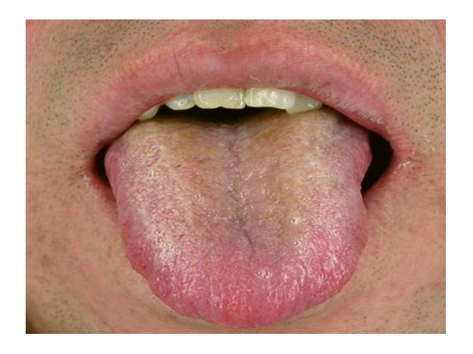
Figure 5 yellow tongue red greasy