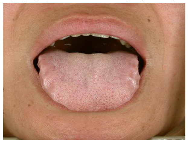
Figure 3 dentate tongue

compared with the results of coronary angiography, found that the plaque tongue