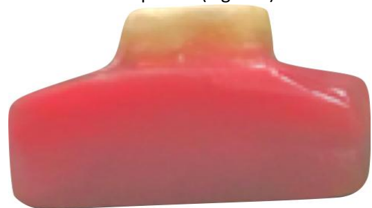
Figure 1: Exposing the Dentin

Sixty freshly extracted, caries-free human permanent molars were debrided using periodontal curettes and were stored in distilled water until use. Flat dentin surface was created on the occlusal surface of extracted teeth with slow-speed diamond disk under continuous water cooling. Then, each tooth was mounted in a chemically cured acrylic resin, such that 3-4 mm of the crown will be exposed. (Figure1).