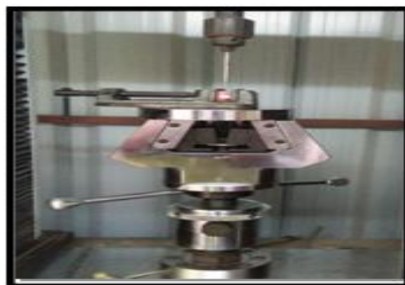
Figure 3: Shear bond strength evaluation using Instron

The thermo-cycled specimens were subjected to shear bond strength evaluation using Instron Universal Testing Machine set at a crosshead speed of 1mm/minute. (Figure 3) The specimens were debonded using a knife edge at the tooth restoration. The break load values were recorded through a computer connected to it. The shear bond values were obtained in MegaPascal (MPa).