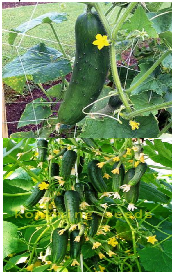
Figure 1: Plant Cucumissativus .