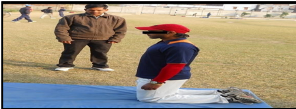
Figure 3.7: Plyometric push-up: Starting position