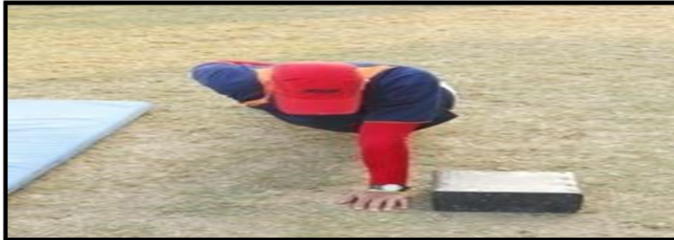
Figure 3.1: Anterior view of subject positioned for the one-arm hop test.

Reliability of medicine ball put test has been established by Vossen J. F. et al 5 in their study as R=.97