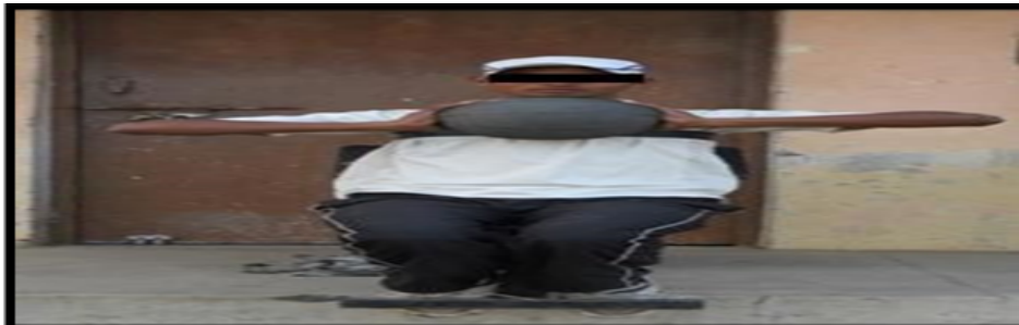
Figure 3.3: Subject performing the medicine ball put test starting position.