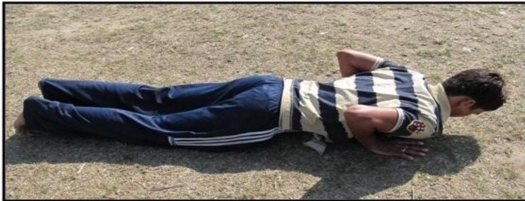
Figure 3.6: Dynamic Push-up: Down position