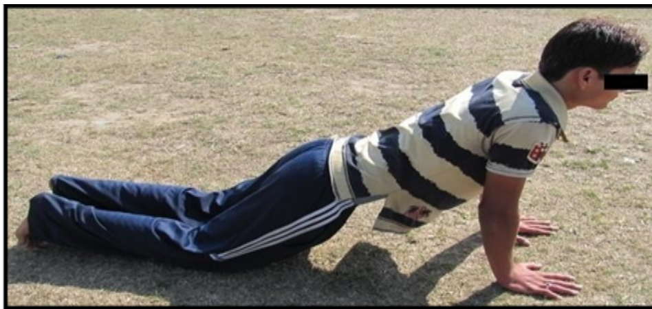
Figure 3.5:DynamicPush-up: Up position

subject gradually absorbed the force of the fall by further flexing the elbows and gradually stopped the movement with the chest nearly touching the floor (Figure 3.9). Immediately after stopping the downward motion, the subject reversed the action by rapidly extending his arms and propelling his trunk back to the starting position (Figure 3.10). and the sets of repetition of exercises are given in (Table 3.1).