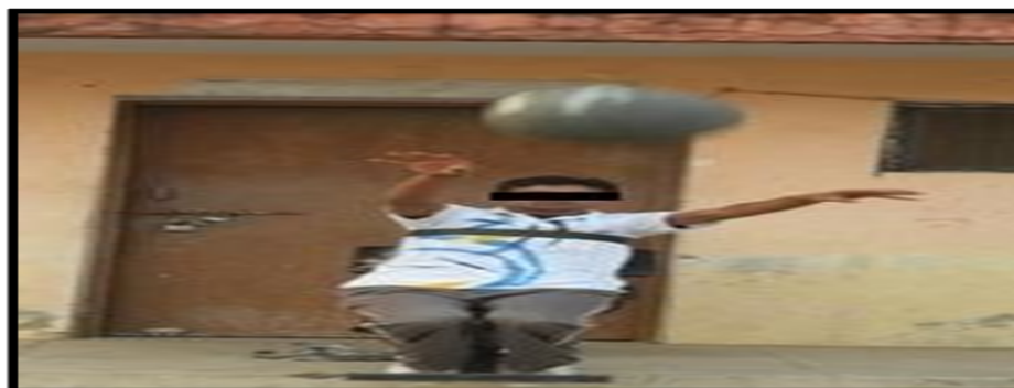
Figure 3.4: Subject performing the medicine ball put test releasing position.