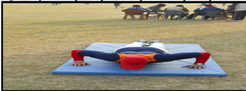
Figure 3.9: Plyometric push-up: bottom position of push-up