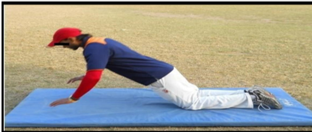
Figure 3.10: Plyometric push up: extend arms position