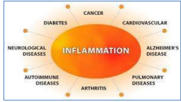
Figure 1.1: Inflammation

noxious chemical compounds or microbiological marketers.