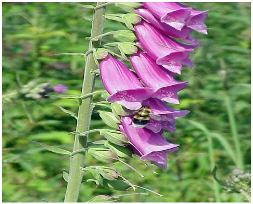
Figure 1: Digitalis (7)

Digitalis is a type of cardiac glycoside. It plays important role in the congestive heart failure therapy and it was first prescribed by England physician and botanist in 18 th century monograph obtained from dried leaves of common foxgloves plants <sup>1</sup> and containing substances that stimulate heart muscle <sup>3</sup> (Digitalis purpurea). Belonging to family scrophulariaceae. in 1785. <sup>1</sup>