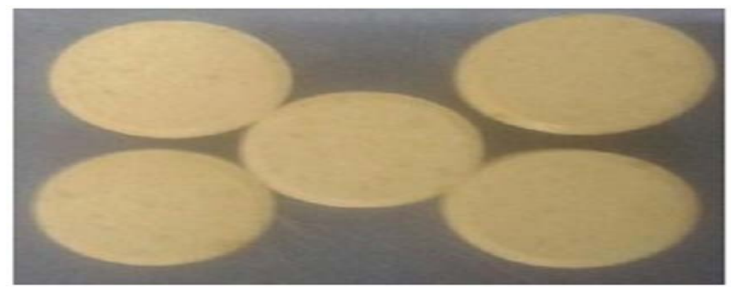
Figure 2: Chewable tablets of Loratadine